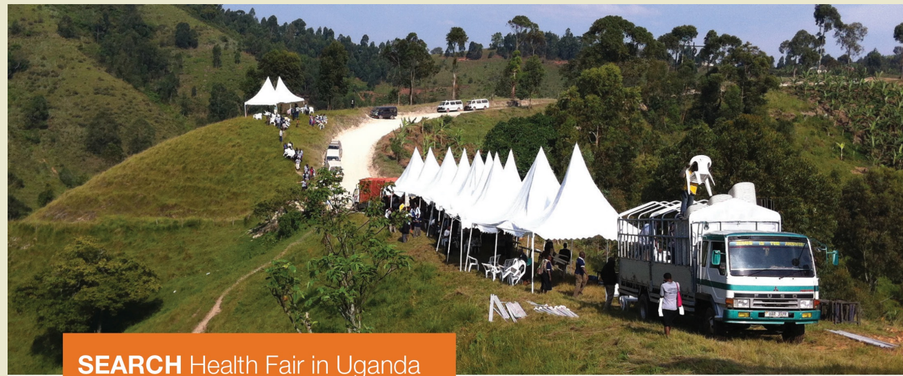
SEARCH Health Fair in Uganda